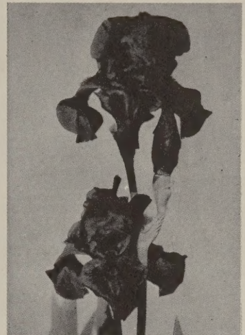
SABLE NIGHT Tall and well branched and almost jet black